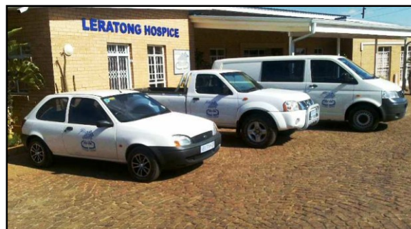
Leratong Outreach Medical Vehicles

The bank accounts to which contributions may be made and will be gratefully received are: