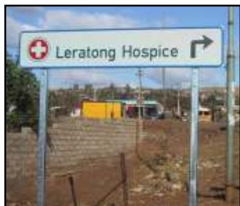
Signage for Leratong from Maunde Street, Atteridgeville