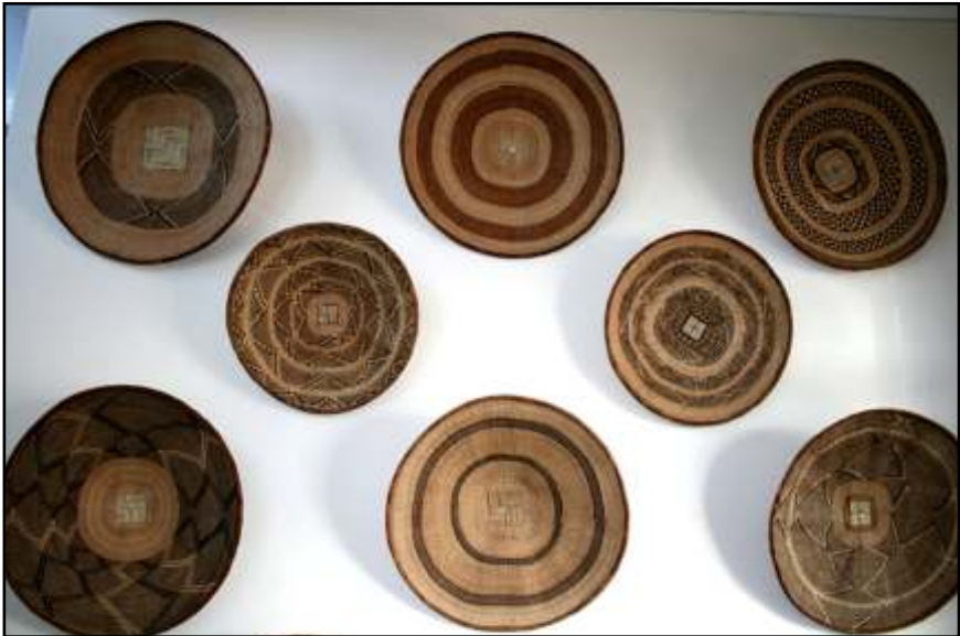
Details from the entrance hall of Leratong hospice. The African baskets on the wall symbolise generosity and giving.