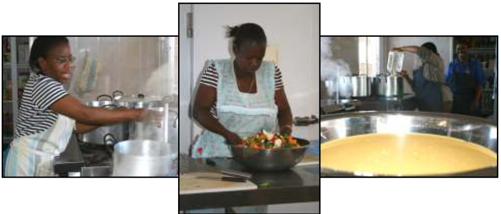
In the kitchen of Leratong, cooks also take care of the patients.

Please note the full version of Leratong annual financial statements (for the year ended February 2007) is available on request from Leratong Hospice. ( www.leratong.co.za )